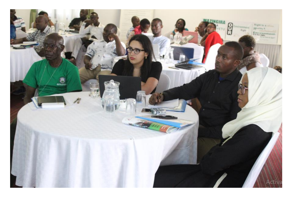
Figure 3: EHRDs and invited international organizations attending the fourth annual workshop