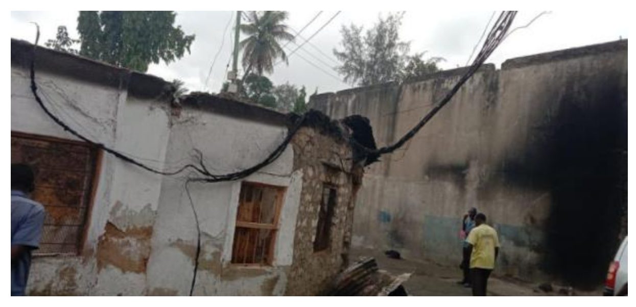
Figure 2: A section of the houses that were razed down in Owino Uhuru